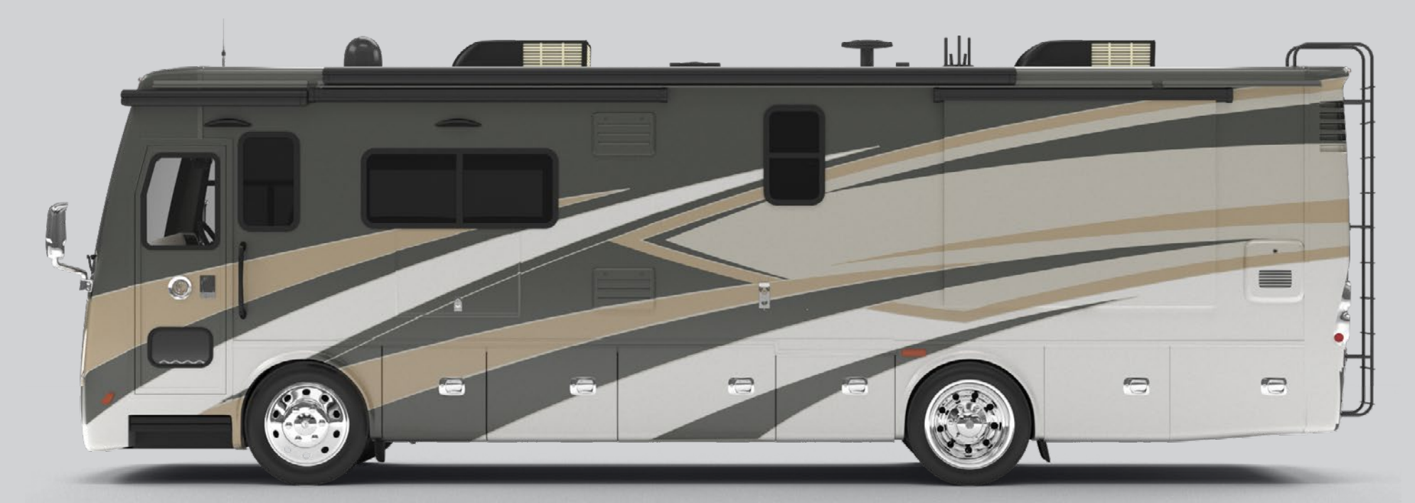
G6 GOLD CORAL