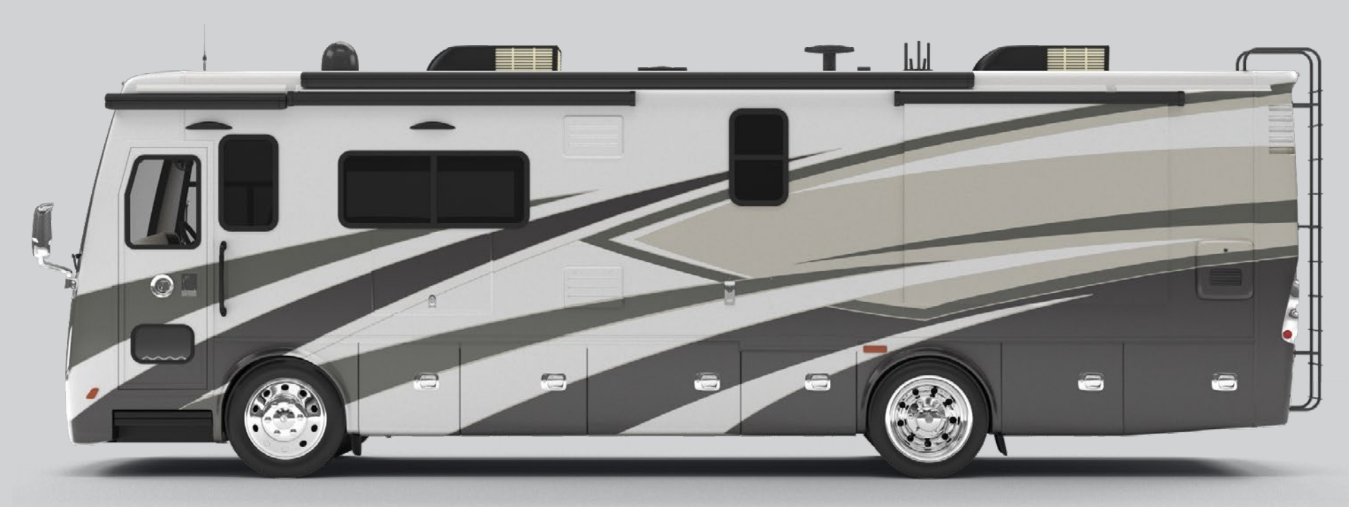
G6 SNOWY MOUNTAIN