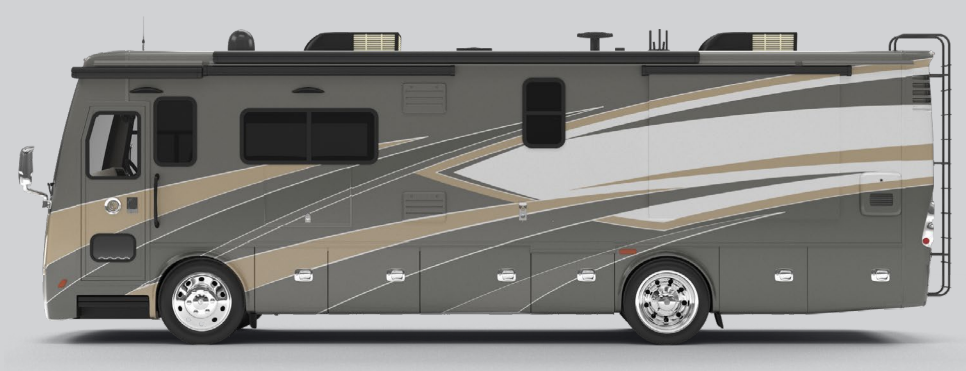
G6 SILVER SAND