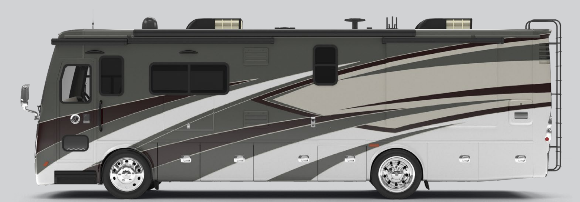
G6 SIERRA MIST