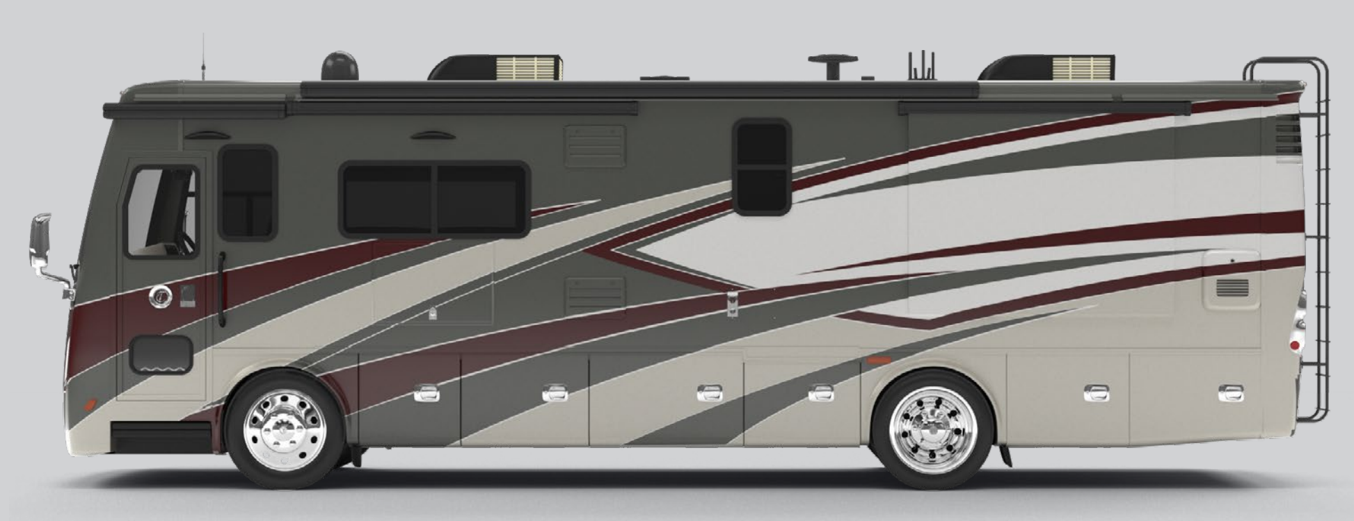
G6 DESERT STORM